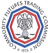
United States Commodity Futures Trading Commission